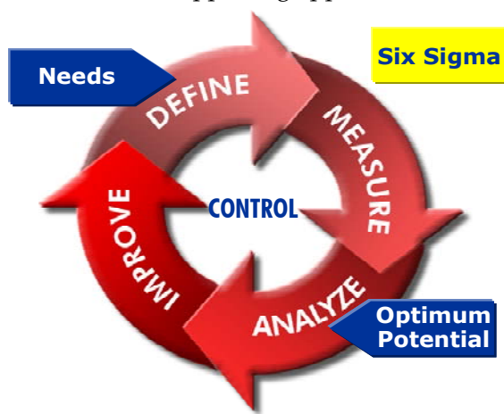
ARC's Operational Excellence Process Model

Many companies are implementing Operational Excellence and continuous improvement programs throughout their entire organization. These programs require companies to analyze and improve their work processes and supporting applications on an ongoing basis. Unfortunately, many process